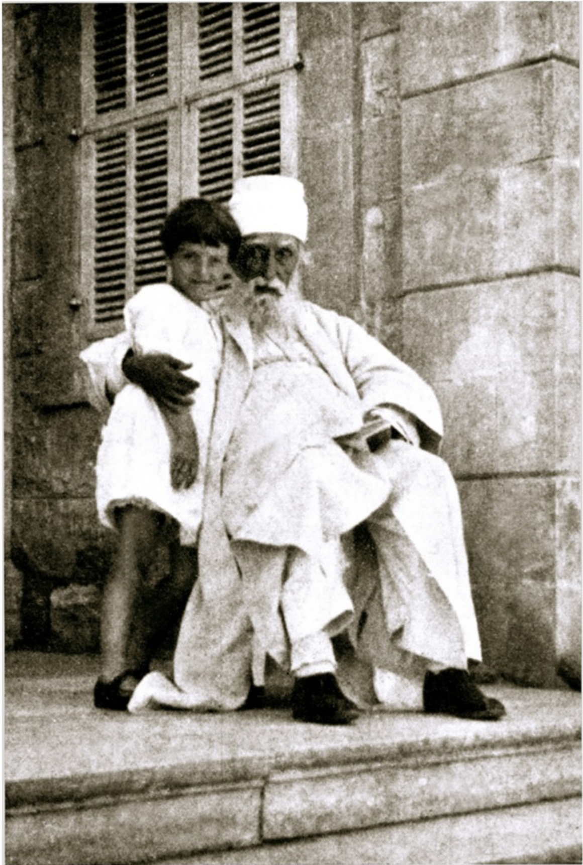
July 1921: Abdu'l Baha with a child outside His house in Haifa