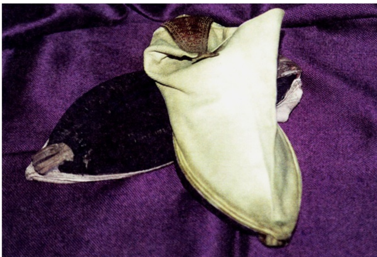
Abdu'l Baha's Giveh - Light Cotton Summer Shoes