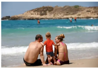
Sunbathers visit the Mediterranean Sea at Dor Beach, northern Israel August 28, 2018. Picture taken August 28, 2018

There were approximately 13% more tourist entries in 2018 than 2017. Comparatively, the increase in global tourism has only grown by 4%.