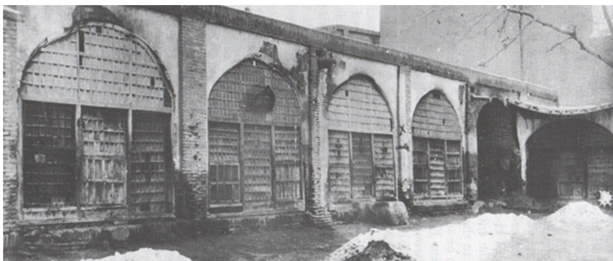
The barrack square in Tabriz, where the Bab was executed