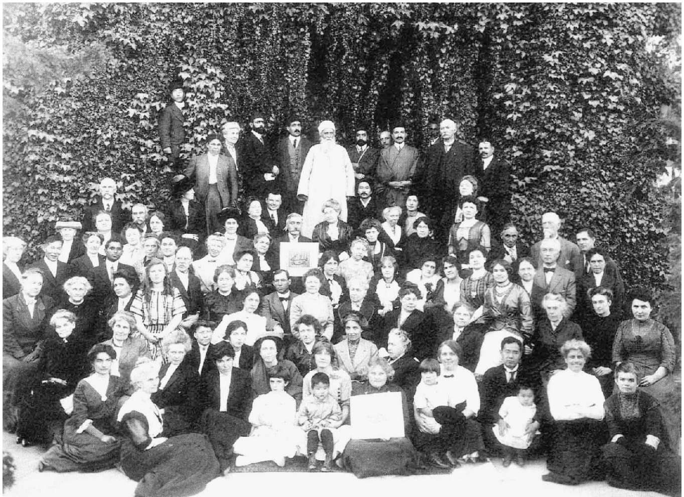
1912 - Abdu'l Baha in Oakland, California