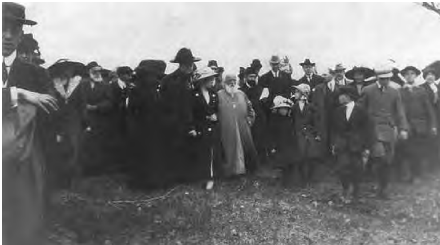
Abdu'l Baha laying the cornerstone of the Mother Temple of the West.