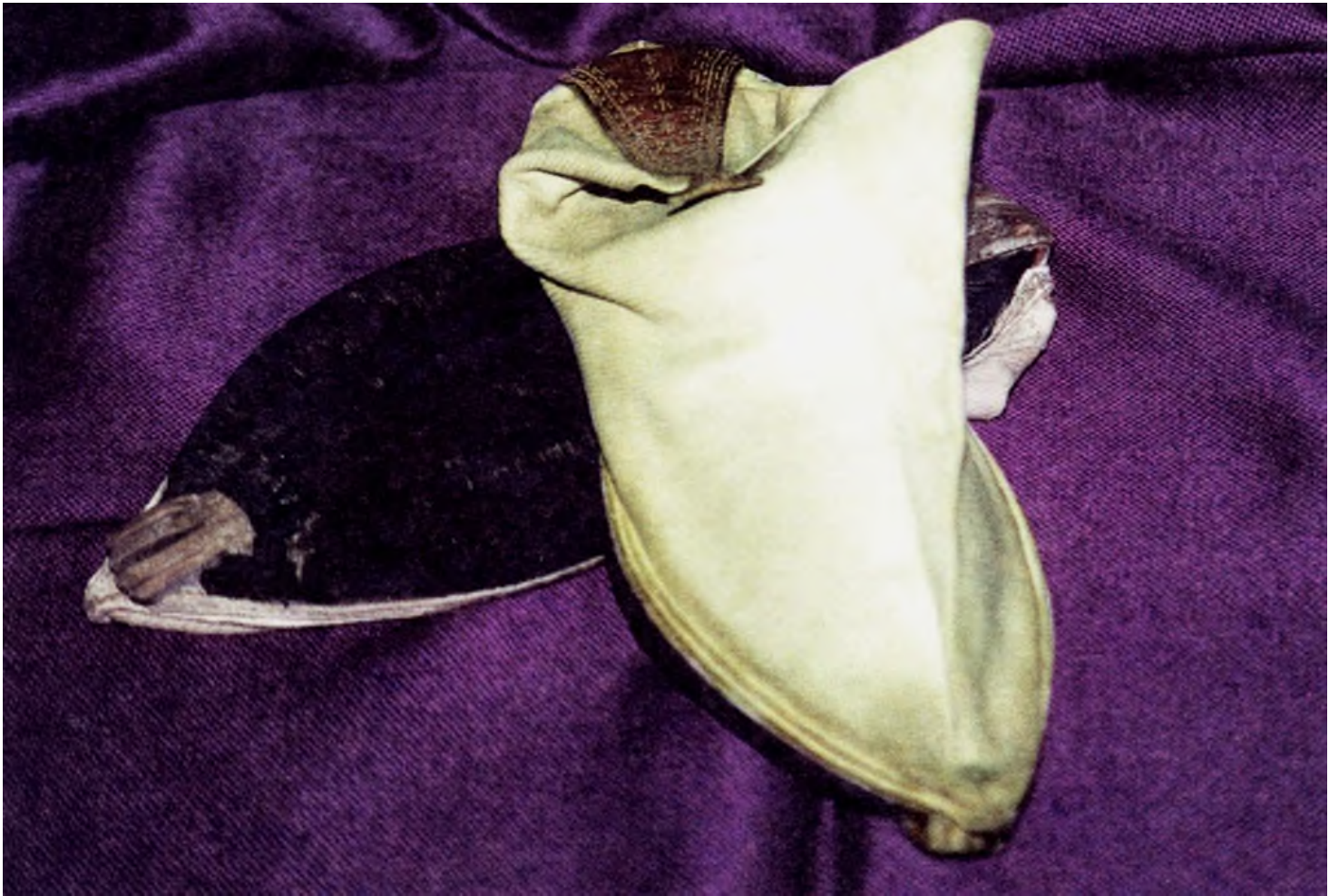
Abdu'l Baha's Giveh (light cotton summer shoes)