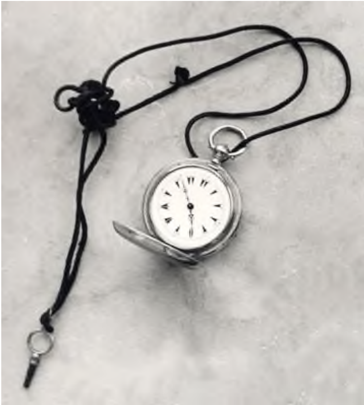
Pocket watch, watch cord and fob belonging to Baha'u'llah.