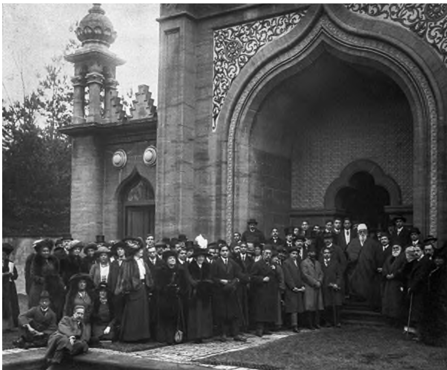
January 1913 - Abdu'l Baha with a group of Egyptian, Turkish, Indian and British friends in a mosque's courtyard in Woking, England