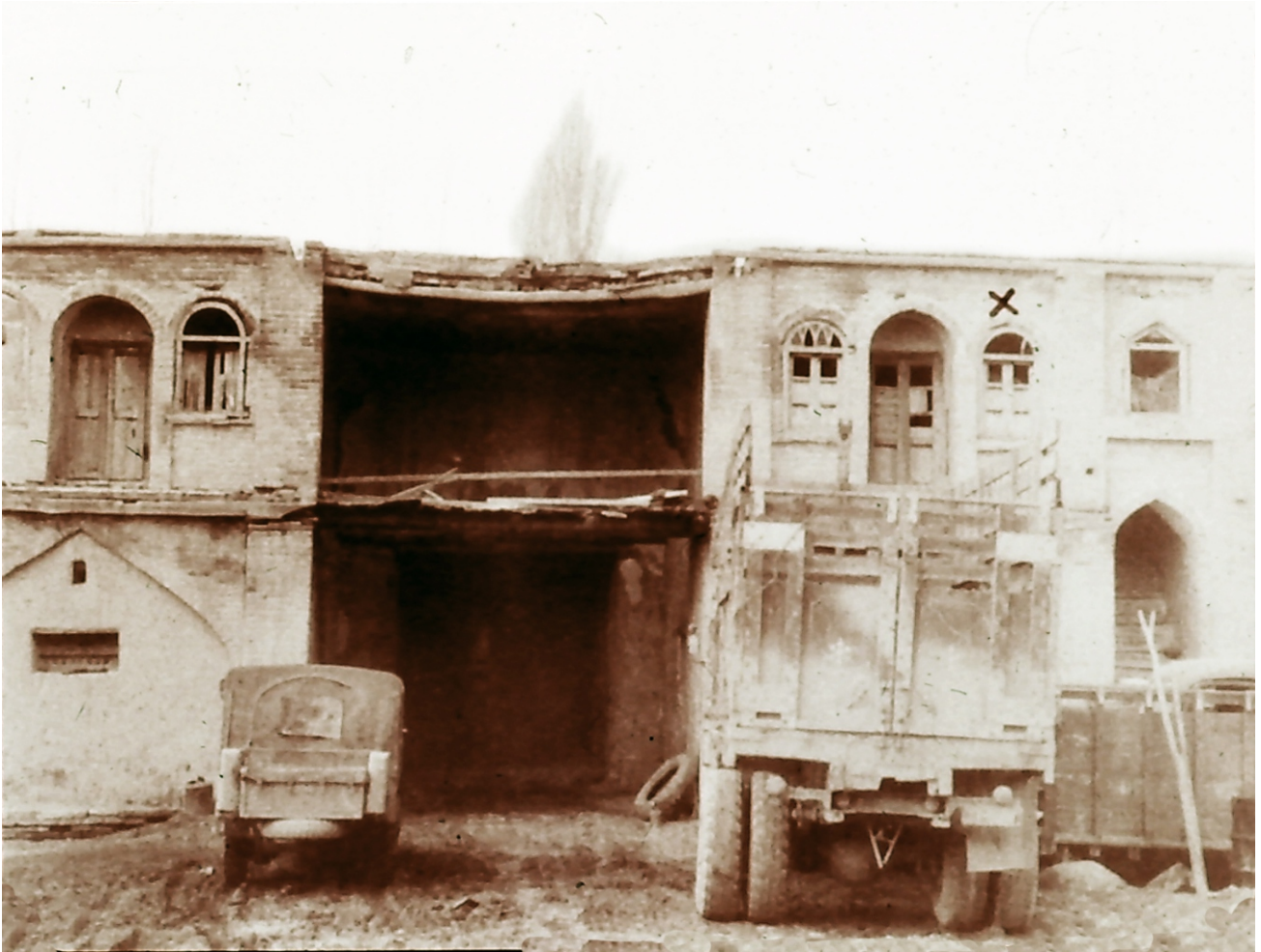
An ancient inn in Zanzibar where the Bab stayed

Views of the dilapidated inn in Zanzibar, Persia, where the Bab stayed in a room on the second floor (here marked with an "X").